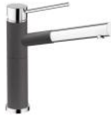
BLANCO ALTA DUAL SPRAY